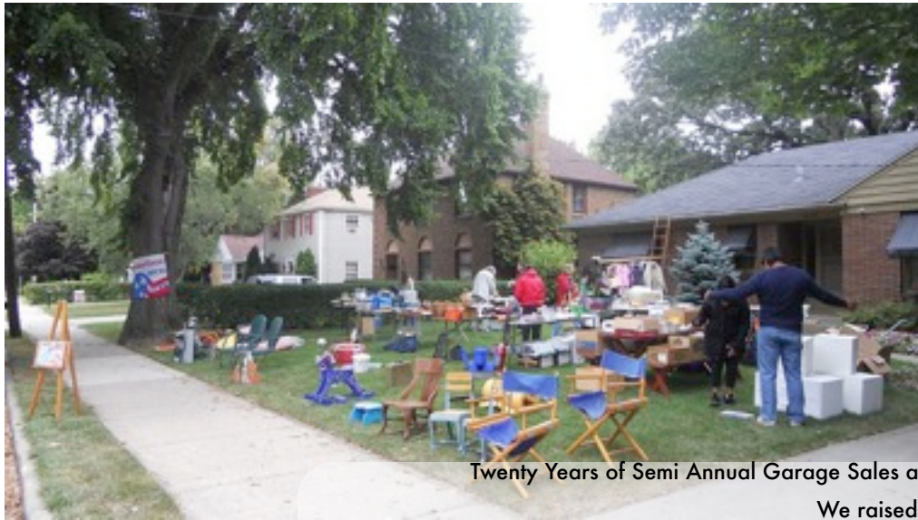
Twenty Years of Semi Annual Garage Sales and this was the best ever! We raised $500 through your help.

Thanks to all who contributed goods, time and hands on support to make this happen.